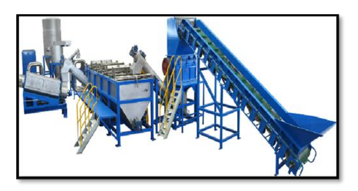
Figure 3. Plastic recycling factory in Semnan