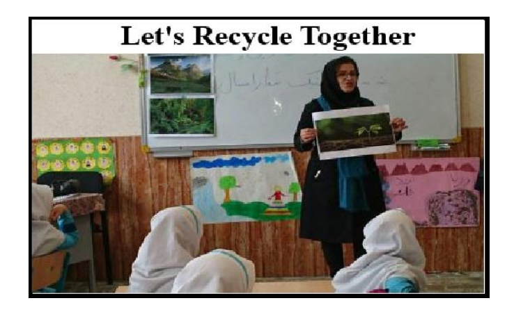
Figure 2. Training program at school